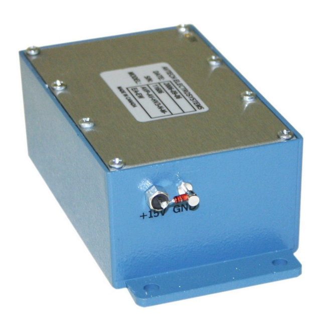
The +15V input terminal is protected with a 1N4746A Zener diode, which will fail as a short if an excessive positive voltage (> 18V), or a negative voltage, is applied to the terminal.