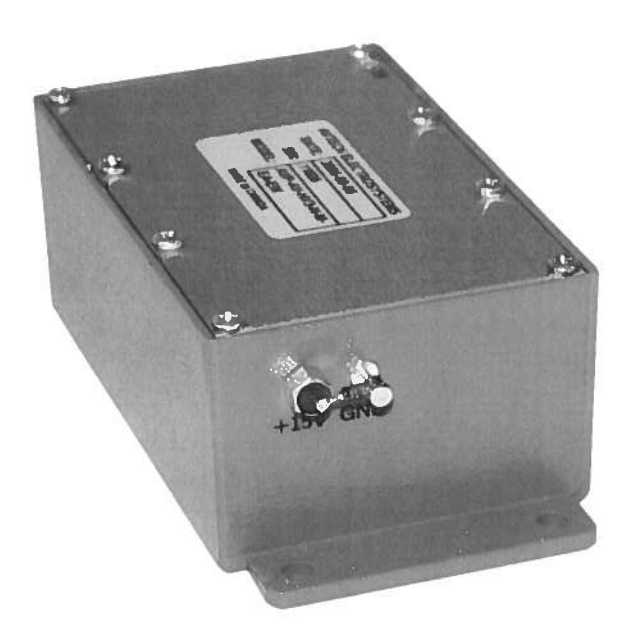
The +15V input terminal is protected with a 1N4746A Zener diode, which will fail as a short if an excessive positive voltage (> 18V), or a negative voltage, is applied to the terminal.